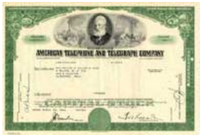
Example stock certificate (Click to enlarge)

A stock is represented by a stock certificate. This is a fancy piece of paper that is proof of your ownership. In today's computer age, you won't actually get to see this document because your brokerage keeps these records electronically, which is also known as holding shares "in street name." This is done to make the shares easier to trade. In the past when a person wanted to sell his or her shares, that person physically took the certificates down to the brokerage. Now, trading with a click of the mouse or a phone call makes life easier for everybody.