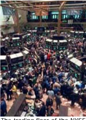
The trading floor of the NYSE

The most prestigious exchange in the world is the New York Stock Exchange (NYSE). The "Big Board" was founded over 200 years ago with the signing of the Buttonwood Agreement by 24 New York City stockbrokers and merchants in 1792. Currently the NYSE is the market of choice for the largest companies in America with stocks like General Electric, McDonald's, Citigroup, Coca-Cola, Gillette, and Wal-mart all residing on the NYSE.